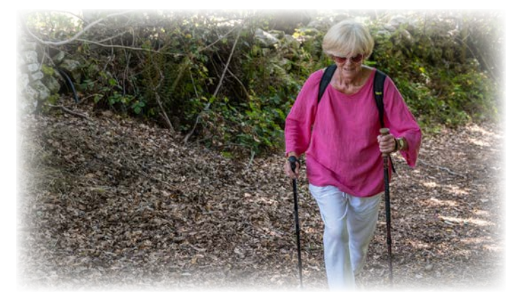
Fitness and walking programs by Fitness Powers.