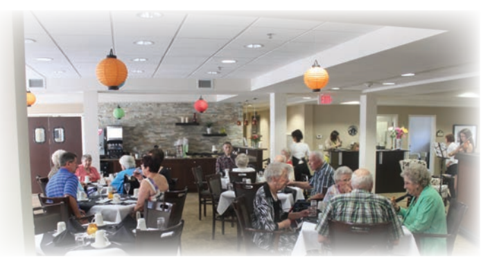
Fresh meals prepared daily, Queensview Retirement Community.