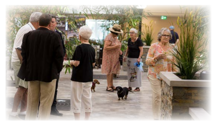
Socializing in the Wellings atrium.