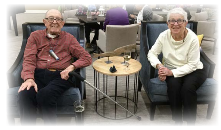
Enjoying the beautiful atrium setting.

All staff must be trained to fulfil our residents' expectations, and in our traditional retirement communities, personal support workers and nurses are available to provide care, as necessary.